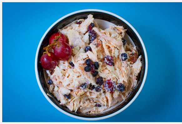
Impress your guests at your summer potluck with this quick, easy and yummy chicken salad!